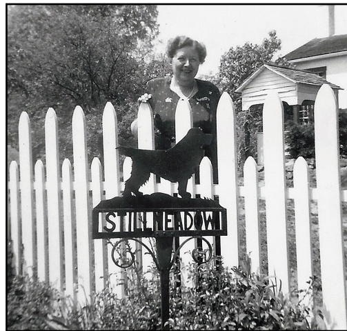
Gladys Taber, circa 1955